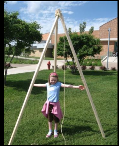
Design Camp for elementary school students: lemonade pavilion - 2008